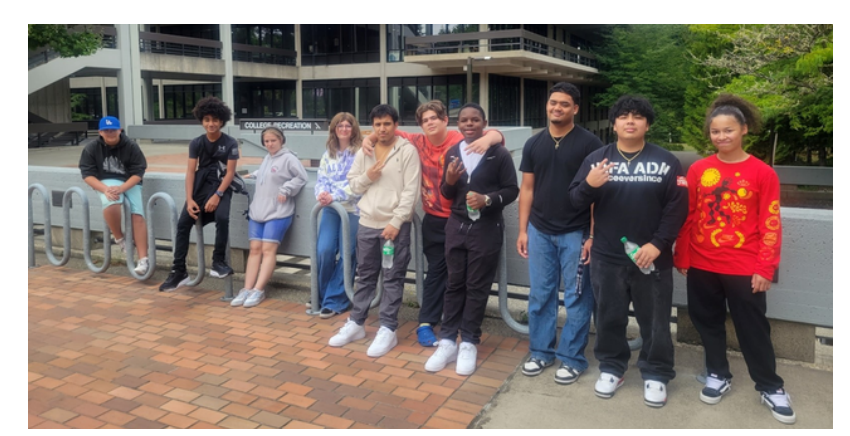
Teens on the Summer College Tour

THANK YOU TO OUR SPONSORS FOR THEIR CONTINUED GENEROSITY AND SUPPORT