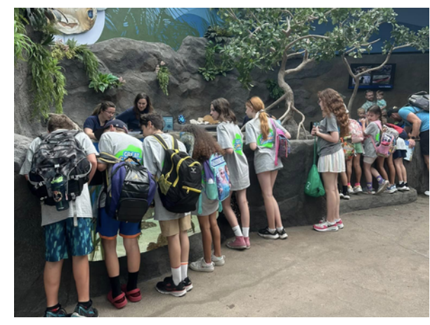
K-5th graders at Point Defiance Zoo